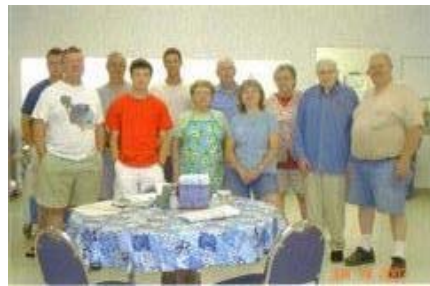
Officers for 2007-2008